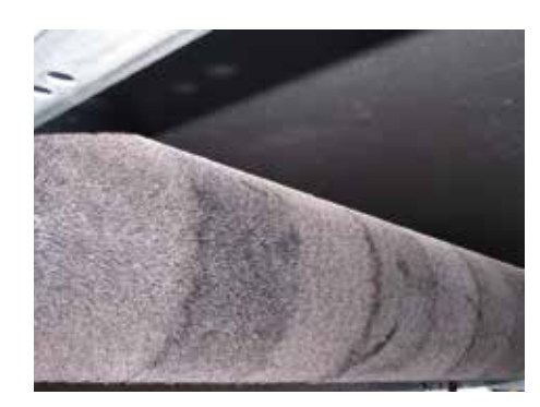
Belt cleaning equipment