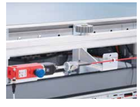
Equipment to achieve CE-conformity: rip cord back to the return belt