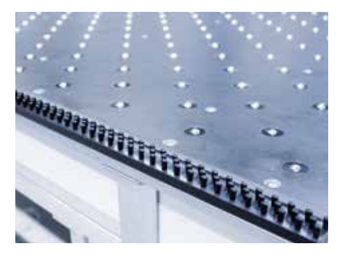
Brake brushes for air cushion table (option)