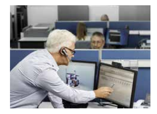
Remote Service: Excellent machine availability thanks to shorter periods of idle time and therefore lower production costs.