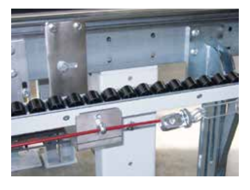
Small roller gib, lowerable (option)