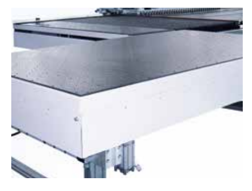
Liftable air cushion table for outfeed (option)